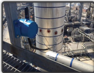
smartPIMS® Cellular with 8 dual-element sensors installed inside CML ports.