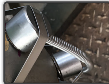
Dual-element sensor attachment can be either magnetic housing, or via strap with temporary or permanent couplant.