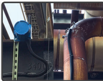
smartPIMS® Cellular with 3 dual-element sensors installed on overhead line.