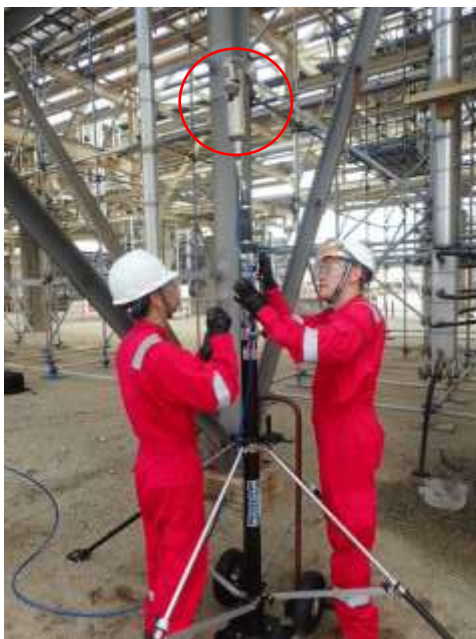
PTZx40 on Telescopic Tower (before extension)

For inspection of pipe supports, the PTZx40 is mounted on a Telescopic Pole or Tower that can be extended and raised up to 9 meters in height. The PTZx40 in this configuration allows for “stand-off” inspections of pipe supports at various heights. The pan, tilt and zoom function allows for inspection of multiple pipe supports in one single vertical deployment. The portable Telescopic Tower can be easily deployed in multiple locations. This increases the efficiency and enables the easy collection of inspection images of pipe supports from multiple angles.