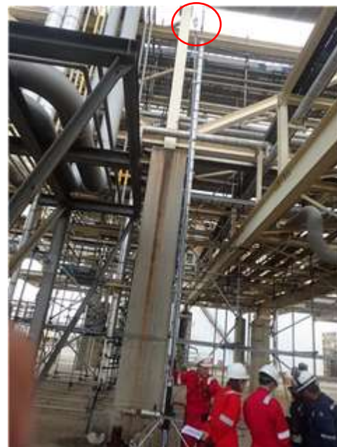
PTZx40 on Telescopic Tower (extended 9m)